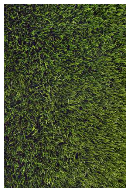
Soft and luxurious, dense and smart. Comfortable and attractive.

40mm pile height / 24 stitch 2,890 gr/m<sup>2</sup> total weight UV resistant P/P cloth and non-woven fabric PE monofilament flat with stripes & PP monofilament curled