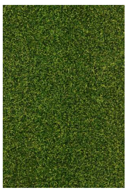
Dense fibres with a perfectly manicured finish for the perfect game.

16mm pile height / 16 stitch 3,000 gr/m<sup>2</sup> total weight UV resistant P/P cloth and non-woven fabric PE monofilament curled