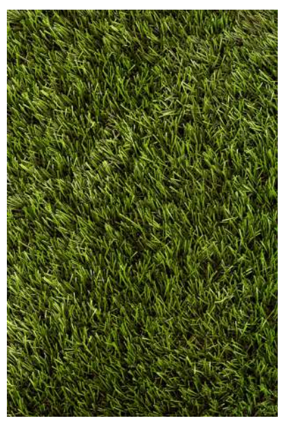
Neat and tidy two tone thatch giving a freshly mowed effect.

30mm pile height / 22 stitch 2,410 gr/m<sup>2</sup> total weight UV Resistant P/P Cloth and non-woven fabric PE monofilament flat with stripes & PP monofilament curled