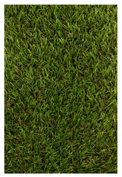
immune to wear and tear.

Dense multi toned thatch zone creating a very natural appearance.